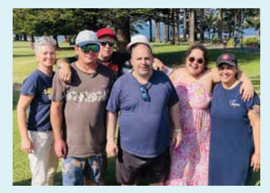
A recent beach outing for BHOS clients and team

Together, this collaboration has secured long term, safe housing for 15 people sleeping rough in the past year!