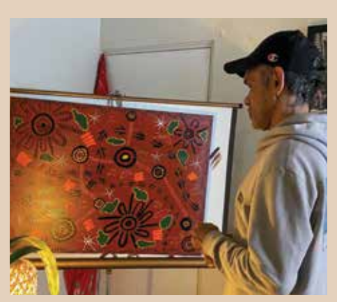
*Name has been changed