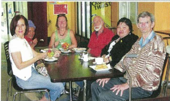
DeSteel Cafe is now a place for people with dementia to meet with others.