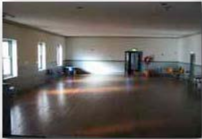
Main Hall - Upstairs